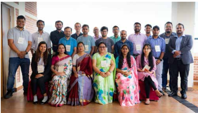
Group photo of participants and resource persons at the part 3 regional training

These events have supported the CORDEX initiative ambitions to increase the usage of CORDEX data in climate change applications and strengthened collaboration between the partner organisations involved in training development and delivery.