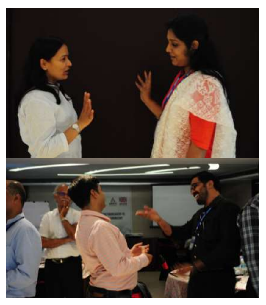
Figure 3: Participants playing 'Snap!'.