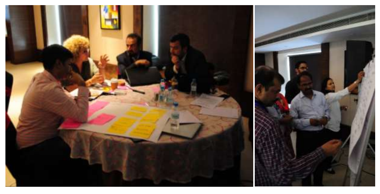
Figure 1: Participants identifying commonly misunderstood terms in our day-to-day work, and voting for their top three words.

For this session, participants were asked to brainstorm a list of words they typically used in their day-to-day working that were often misunderstood or misinterpreted. They then discussed these words in small groups and flagged words that could have different meanings in different contexts. The aim of this session was not to agree on a single definition for these words, but rather bring the issue of multiple definitions and understandings to the surface. The groups then fed back their list of terms to plenary, and each participant was asked to 'vote' using stickers for their top three words which they feel need to be used with caution. Figure 3 depicts the full list of terms identified in this session, with the font size relating to how many votes each term received. The top terms identified in this session were normal, users and likelihood.