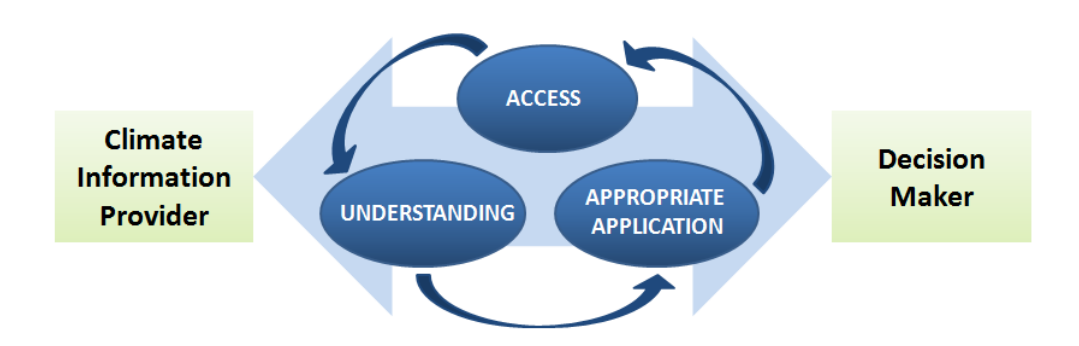
Figure 1: The process of enabling climate information to effectively support decision-making<sup>4</sup>. The process of enabling relevant scientific understanding of climate risk to support resilience building includes three inter-connected stages of 'access', 'understanding' and 'appropriate application' and is dependent on the creation or identification of ongoing channels for collaborative dialogue between climate information providers and decision makers.

As outlined in Figure 1 below, co-producing climate information which is tailored to supporting specific decision making processes involves: (1) enabling decision makers to access relevant climate information; (2) developing a shared understanding of decision processes, capacities and risks and how relevant climate information can support these, and (3) supporting appropriate application of decision-relevant information.