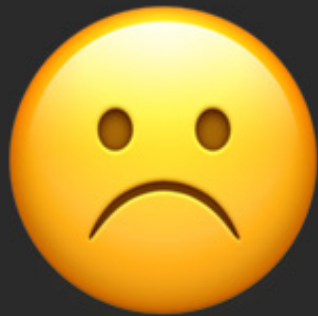
Air pollution problem

Match up the air pollution problem cards with air pollution solution cards