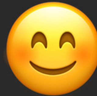
Air pollution solution